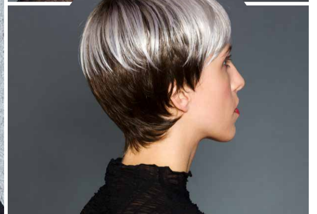
THE BEAUTY Dark-Cherry