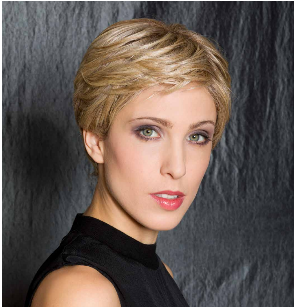
SUPERGA MONO SF+ Salt-Root