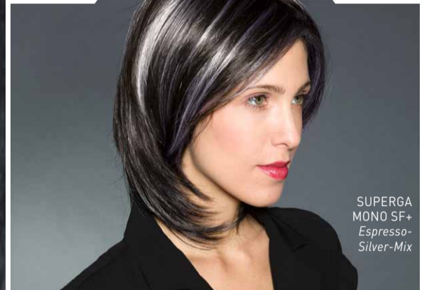
SUPERGA MONO SF+ Espresso-Silver-Mix