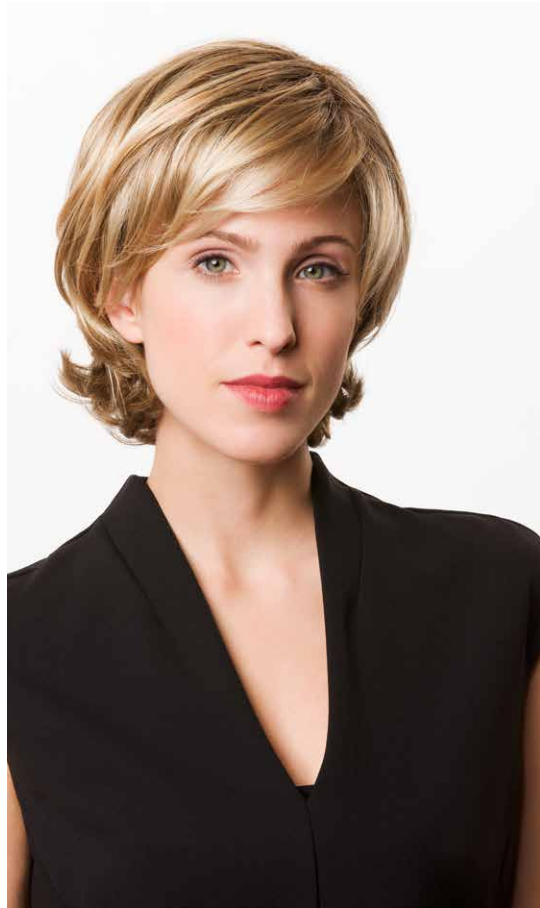
SONATA SF Vanilla-Mix-Root

As your BelleMadamé hair replacement specialist, we will offer you our professional advice and skills. Together we will procure the correct hair solution for you to wear for some time to come. This partnership will also help to eliminate any more excessive thought or ambivalent feelings about your choice. Our goal is to help make your choice as easy and seamless as possible. In order to give you some ideas, on the following pages we will show you a small selection from the diverse BelleMadamé collection: