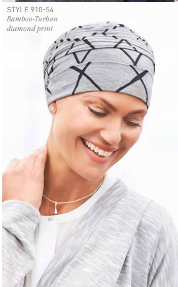
STYLE 910-54 Bamboo-Turban diamond print