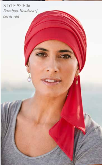
STYLE 920-06 Bamboo-Headscarf coral red