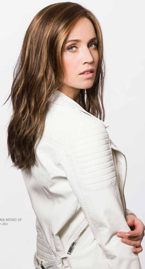
ANGELINA MONO SF Chocolate-Mix

Monofilament is an extremely thin gauze with single-hair knotting, and is remarkably lightweight and breathable.