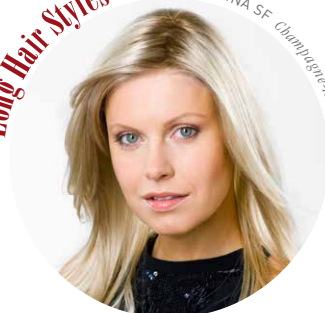
GINA SF Champagne-Floor