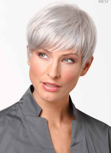
CARLOTTA SF Swedish-Blond-Root