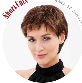
WANJA SF Dark-Red-Bliz