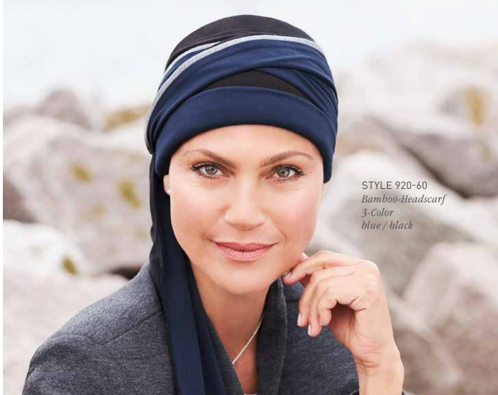
STYLE 920-60 Bamboo-Headscarf 3-Color blue / black