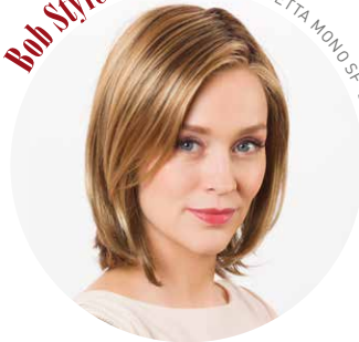
MARIETTA MOND SF Caramel-Floor