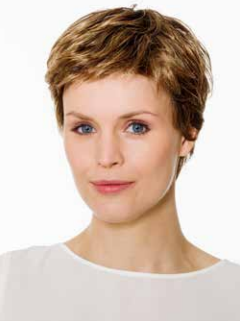
MARIETTA MONO SF Vanilla-Root