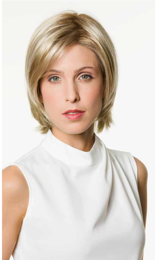
SUNRISE SF Nordic-Asb-Blond

As your BelleMadamé hair replacement specialist, we will offer you our professional advice and skills. Together we will procure the correct hair solution for you to wear for some time to come. This partnership will also help to eliminate any more excessive thought or ambivalent feelings about your choice. Our goal is to help make your choice as easy and seamless as possible. In order to give you some ideas, on the following pages we will show you a small selection from the diverse BelleMadamé collection.