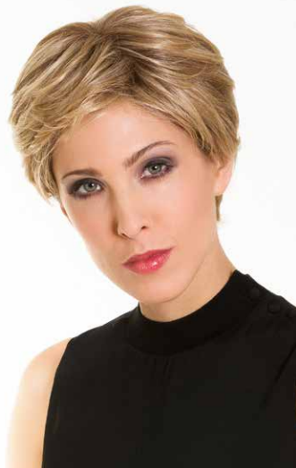
THE CHARMING Chocolate-Mix