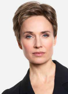
VICKY MONO SF Champagne-Mix-Root