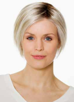
SIRI MONO SF Snow-Blond-Root