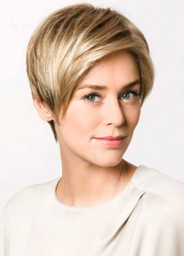
LIGHT MONO SF Salt & Pepper