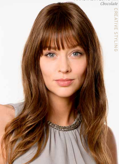
MUSETTA RH Chocolate/Cream-Root