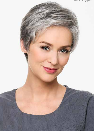
LIGHT MONO SF Salt & Pepper