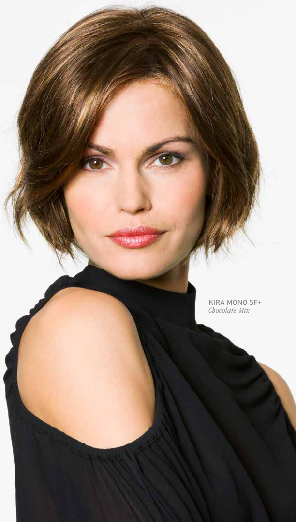
KIRA MONO SF+ Chocolate-Mix

Monofilament is an extremely thin gauze with single-hair knotting, and is remarkably lightweight and breathable.