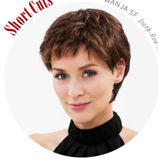
WANJA SF Dark-Red-Bliz