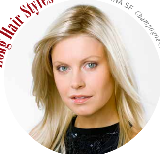
GINA SF Champagne-Floor