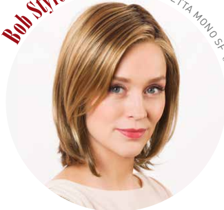
MARIETTA MOND SF Caramel-Floor