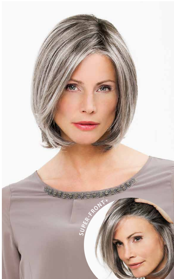
ELITE MONO SF+ Dark-Grey-Root

Therefore the majority of BelleMadame wigs are featured with Super-Front (SF).