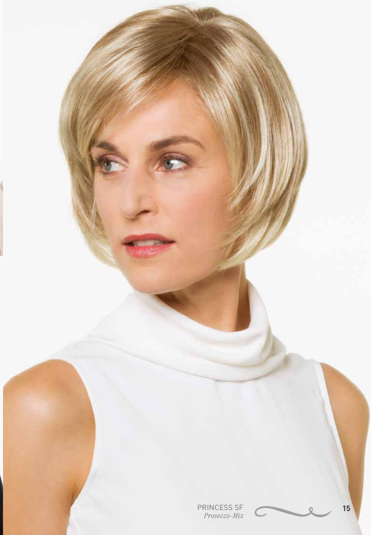
PRINCESS SF Prosecco-Mix